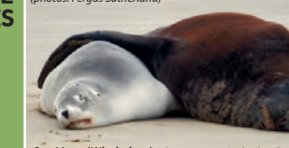
Sea Lions (Whakahao)

Check out the Tiaki Promise – www.tiakinewzealand.com