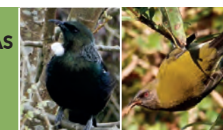
Tui (left) and Bellbird (Korimako/Makomako)

BEST WILDLIFE VIEWING SITES Nugget Point Surat Bay Curio Bay Waipapa Point