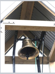
The Owaka Schools Bell ... celebrating 150 years