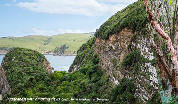
Ruggedness with amazing views

View the sweeping Tautuku Beach and Bay from Florence Hill . To the east is the rugged Papatowai coastline where surfers from New Zealand and elsewhere come to surf the big waves of the southern ocean. At Papatowai is the Shanks Bush Nature Trail with a 20 minute return walk to enjoy many different natural habitats with activities for young people, and the Old Coach Road .