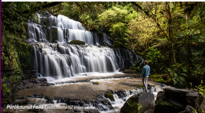
Pūrākaunui Falls