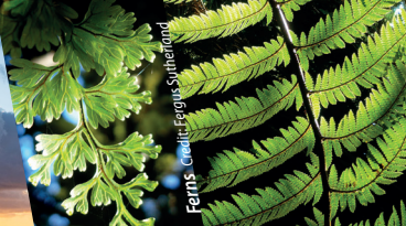
Ferns