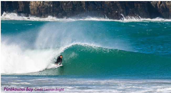
Pūrakaunui Bay