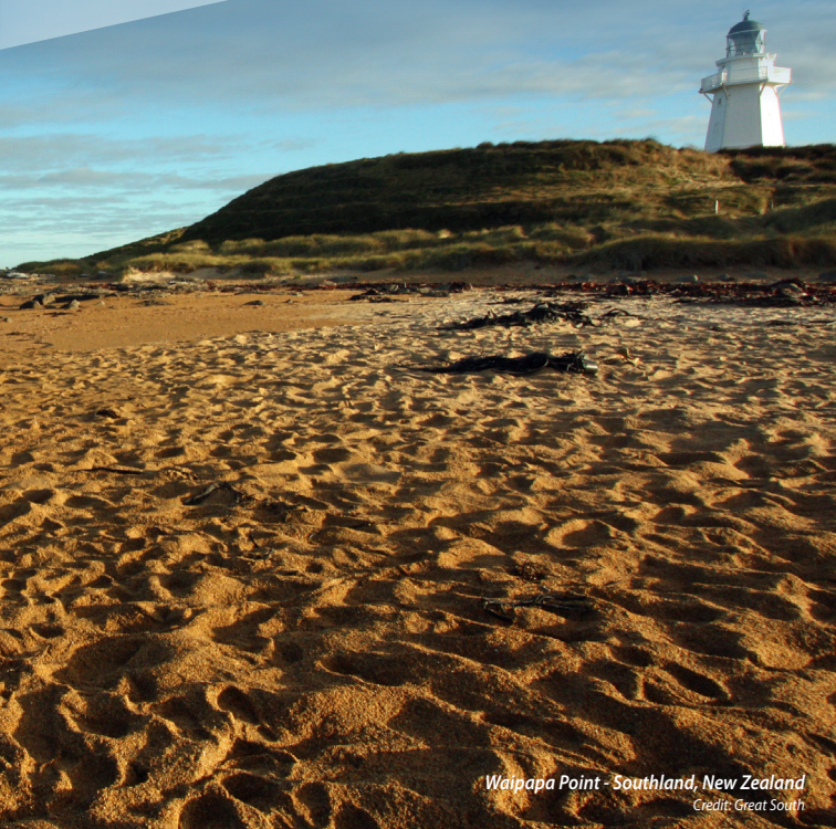
Waipapa Point - Southland, New Zealand