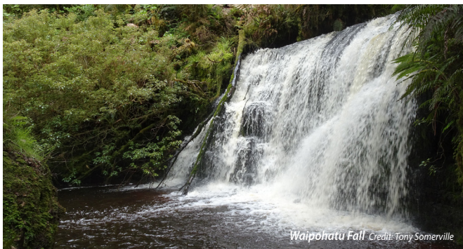
Waipohatu Fall

For bookings please visit our website 517 Waikawa-Curio Bay Road, Curio Bay Phone 021 044 8378 Email stay@curiobaysalthouse.co.nz