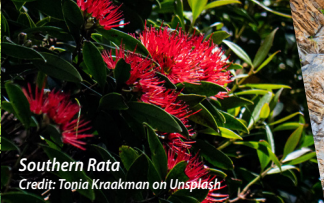
Southern Rata