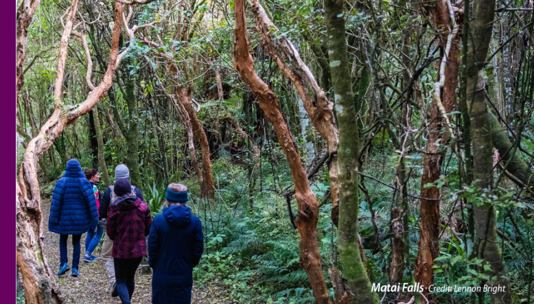
Matai Falls

bush, this magnificent waterfall cascades 20 metres over three distinct tiers (20 minutes return). Other enjoyable waterfalls are McLean Falls (40 minutes return) and Matai Falls (30 minutes return). Also at Matai Falls, the Matai Rail Trail (1 hour return).