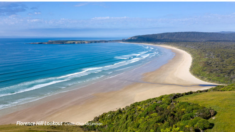
Florence Hill Lookout

Slope Point/Waipapa the southernmost point of the South Island, has windswept trees and a magnificent view over the southern ocean.