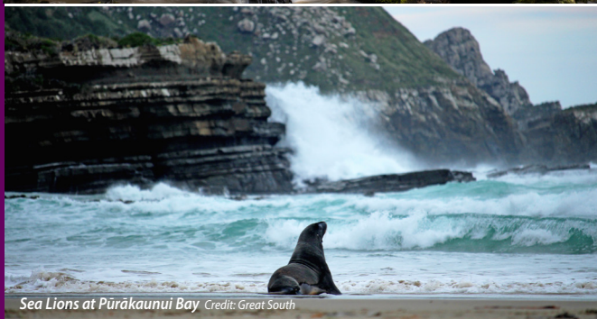
Sea Lions at Pūrākaunui Bay