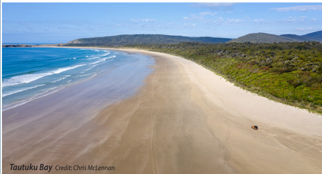
Tautuku Bay