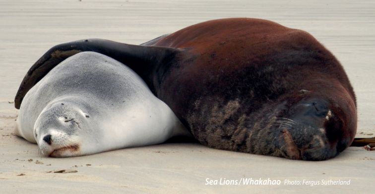
Sea Lions / Whakahao