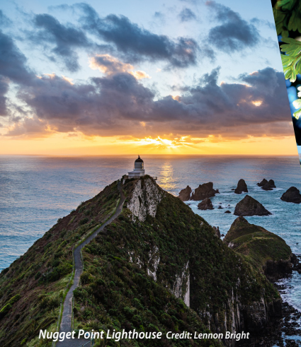
Nugget Point Lighthouse