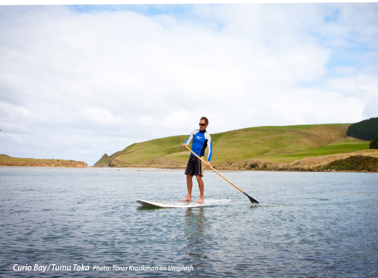
Curio Bay / Tumu Toka

Pūrākaunui Falls is a picture of beauty. Surrounded by bush,