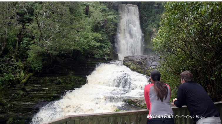
McLean Falls

Lake Wilkie is reflective and peaceful. There is a clear succession of naturally establishing forest here. During summer the red brilliance of flowering Rata is stunning (30 minutes return).