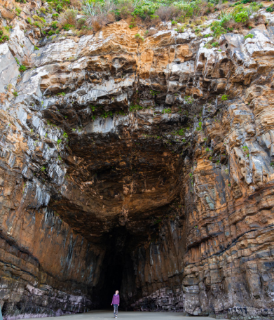
Cathedral Caves

Waipōhatu is a tranquil picnic area offering a short 20 minute wheelchair track and a longer 3 hour wilderness track through native bush.