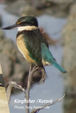
Kingfisher / Kotarē