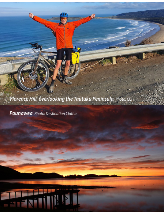
Florence Hill, overlooking the Tautuku Peninsula

17 Niagara Falls Café/Restaurant All day homemade menu – arts & crafts gallery 256 Niagara Waikawa Road, Niagara, South Catlins P: 03 246 8577 E: niagarafallscafe@xtra.co.nz www.niagarafallscafe.co.nz