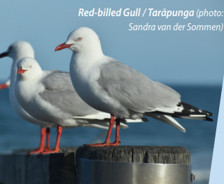
Red-billed Gull / Tarāpunga