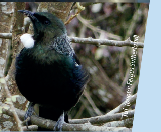
The Whio