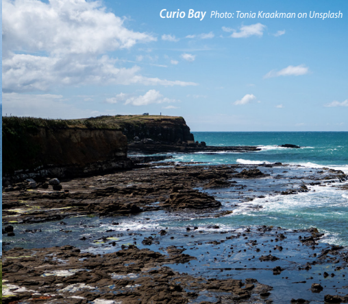
Curio Bay