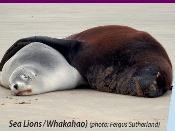
Sea Lions / Whakahao