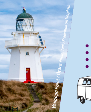
Waipapa Point / Ōtara