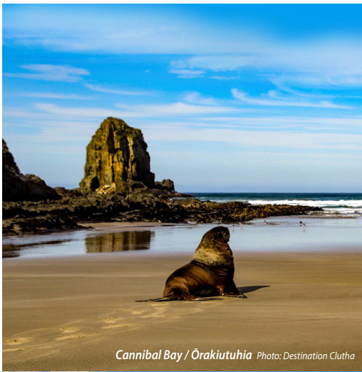
Cannibal Bay / Ōrakituhia

22 Tokanui Multi-Play Park Skate ramps, tar-sealed scooter track, BMX bike track Tokuani Multi-Play Park McEwan Street, RD1 Tokanui (opposite the playground)