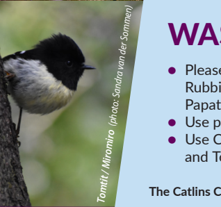
Tamiti / Mironiro