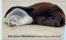
Sea Lions / Whakahaao