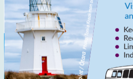
Waipapa Bay Lighthouse