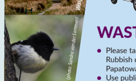
Small / Memeo