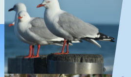
Red-billed Gull / Tarapunga